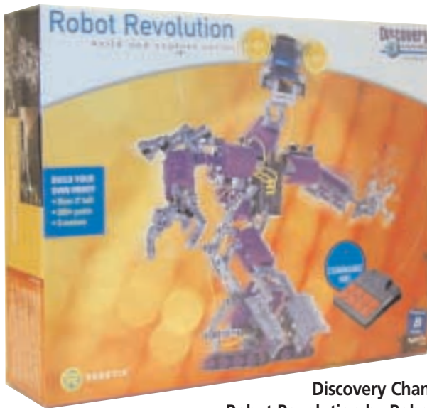
Discovery Channel Robot Revolution by Robotix

The Atlantis Paradise Island Resort features 38 restaurants, bars and lounges; an entertainment center with casino; a collection of luxury boutiques and shops; plus a full service spa and an 18-hole putting course. The resort includes the largest man-made marine habitat in the world, home to 50,000 live sea animals in exhibit lagoons and displays. You'll marvel at The Dig, a maze of underwater corridors and passageways providing a journey through the mythical land of Atlantis. There are also water slides hidden in life-sized Mayan ruins, cascading waterfalls, and an almost endless beach that's gorgeous beyond description.